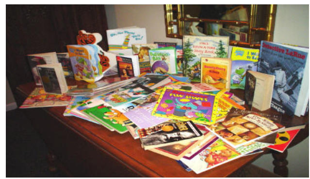
Durham Public Schools' Bookmark Project